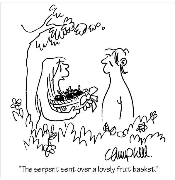
"The serpent sent over a lovely fruit basket."

Answer: pray, daily, bread, door, ask, seek, find, fish, snake, gifts; Holy Spirit